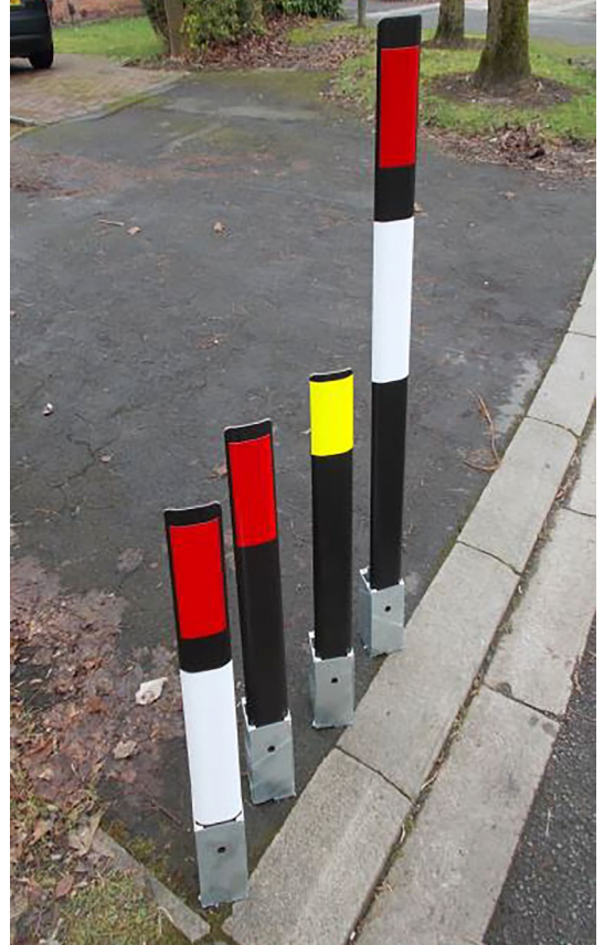
Fleximarker posts are 1400mm high in both hard and soft landscape, with shorter versions available. The vinyls are available in a range of colour combinations.